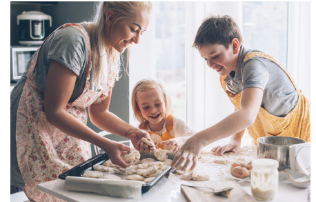
Children often learn by doing, so helping in the kitchen is important.

By offering classes virtually, parents who did not have transportation were able to participate. The curriculum included learning knife skills, kitchen and food safety, how to read a recipe, and measuring. As a result of the classes, 100% of the students improved in food safety practices, safe food handling activities, and improved physical activity. The students used their knife skills and measuring skills to prepare seven recipes which their families had for their evening meal. According to one parent, “my daughter helps me cook dinner every night”.