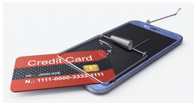
Scams come in all shapes and sizes and on all platforms now.

Ninety-six percent reported that they know at least two ways to protect themselves from fraud.