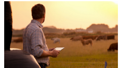
A farmer evaluates his livestock and needed changes.

A survey at the conclusion of the series revealed over 70% plan to implement a recordkeeping system in their herd. One third plan to update facilities and increase hay yields to help offset grain cost. Fifteen percent (15%) indicated that herd health and introducing better genetics into their herd was a long term change they were going to implement on their farms. All agents agreed the success of this series indicates we need to offer more intense and “next level” classroom and field day programs for all our cattle producers. Plans are underway to offer these educational programs soon.