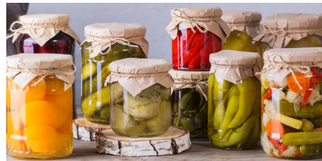
Having the ability to sell home grown vegetables provides additional income to local farmers.

Kentucky’s Homebased Microprocessing Program (HBM) contributes to the variety of foods offered at local farmer’s markets. It is a unique collaboration with the UK Cooperative Extension Service, Department of Agriculture, and Department for Public Health - Food Safety Branch. The program allows Kentucky farmers to produce certain acidified and low acid canned foods in their home kitchens. Participants must grow the main ingredient in the products they process, and recipes must be approved by a food preservation specialist at the University of Kentucky to ensure product safety. Products can then be sold from their farm, a farmers market registered with the Kentucky Department of Agriculture, or a KY Farm Bureau Certified Roadside Market which ultimately increases access to local food sources for customers and profits for the farmer.