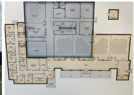
Our Temporary Office